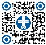
Baptist Health System

1. PRE-REGISTER. We highly encourage you to pre-register for your hospital stay as soon as possible. By completing the required paperwork ahead of time, you will have one less thing to worry about when your big day arrives. A pre-admission form is included with this Women's Services guide. Upon pre-registration, you'll be given an estimate based on your insurance. Register in person at the hospital or scan the code: