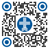
Resolute Baptist Hospital

2. TAKE THE CHILDBIRTH EDUCATION HOSPITAL CLASSES. Our hospitals offer many classes for expectant parents, such as childbirth preparation, infant breastfeeding and newborn care. The more you know ahead of time, the more in control you'll feel once the baby arrives. Classes are available online and in person.